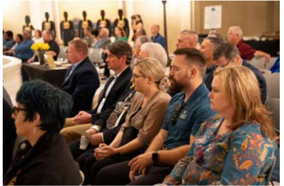
Sometimes, tragedy strikes and loved ones don't return from work. To honor their memory, CompSource Mutual joins with the Workers' Memorial Day Commission, a group of civic and community leaders, on Workers' Memorial Day.